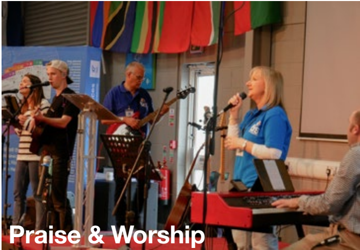
Praise & Worship