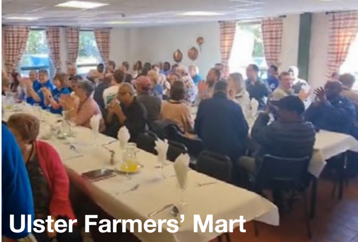
Ulster Farmers' Mart