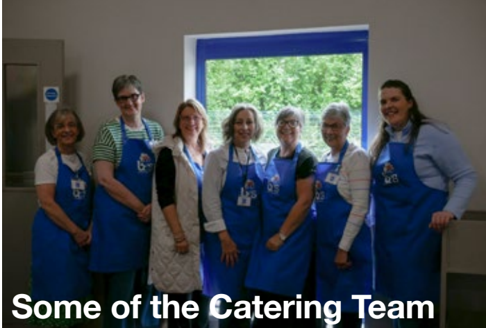
Some of the Catering Team

moral sense. His thought-provoking answers sparked the curiosity of many. For more information, you can refer to his book: "2084 Artificial Intelligence and the Future of Humanity".